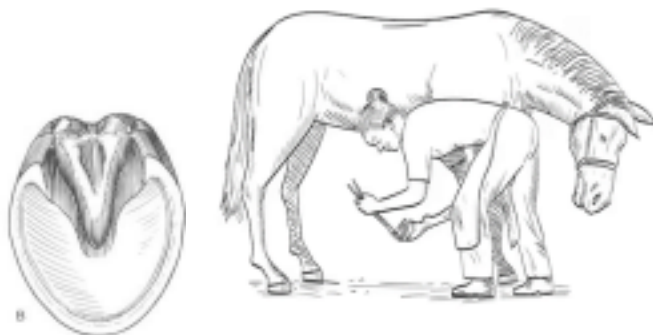
Solar photo angle